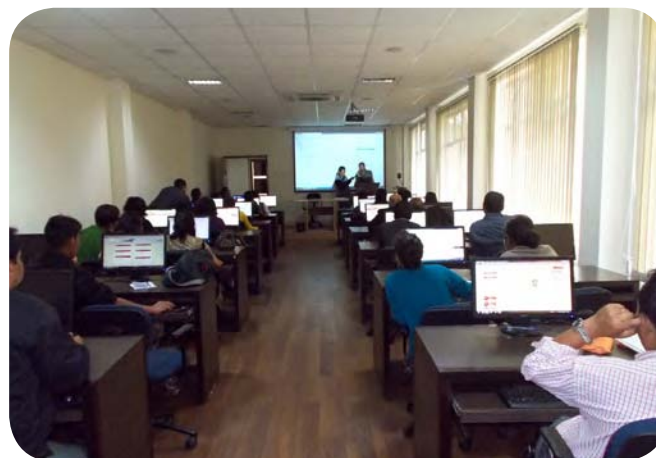
Training On National Tracking System For Missing And Vulnerable Children

The District Child Protection Officers attended the training held from 19th – 23rd February, 2013 at National Institute of Public Co-operation and Child Development (National Institute of Public Co-operation and Child Development), Guwahati. The Resource Persons from different departments of the Institute gave a presentation on the following items which was followed by discussion :