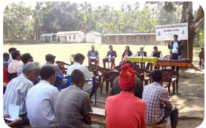
Legal Literacy cum Awareness Programme

Organised Legal Literacy cum Awareness Programme for Women and Children at Rewak U.P. School in collaboration with Meghalaya State Legal Services Authority and Deputy Commissioners, South Garo Hills, Baghmara. The officers participated in the celebration of International Women's Day on 8th March, 2013 at RC Compound, Baghmara