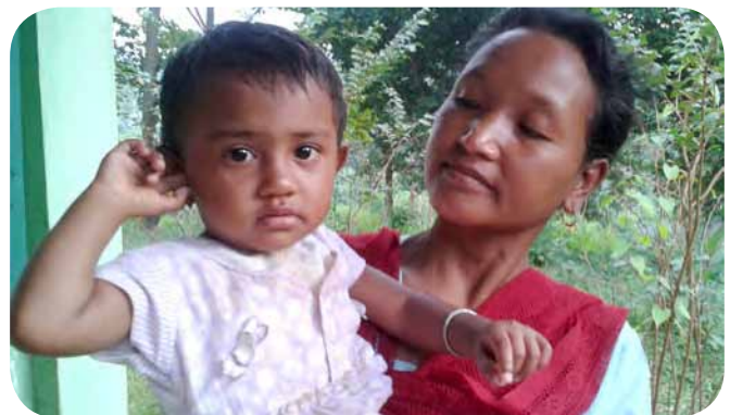
Child with foster mother

The officers visited the place in Dalu area, West Garo Hills on the 9th June, 2012 and met with the children affected in land dispute and where inquiries was conducted and follow up was done. Also, cases and inquiry was conducted on runaway and missing children, trafficking, molestation and adoption case on which further inquiry and agreement was made to give the child for adoption and the matter was later brought to the Child Welfare Committee (CWC).