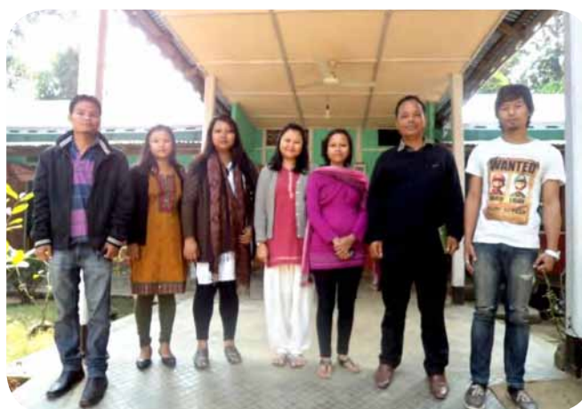
House of Mercy, Williamnagar, East Garo Hills