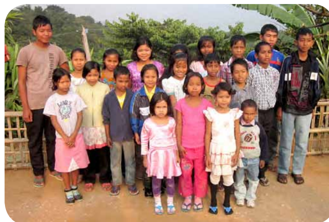
Children of Free Life Center Orphanage Home at Sanchongre

14.09.2012 – Again a joint visit was done in Dalu market and found one boy of 14 years working in a hotel and earning Rs. 100/- a day. The employer was informed and advised to send back the child since it is a crime/punishable to employ a child.