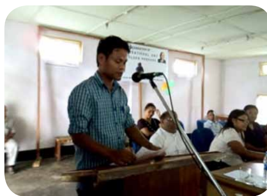
International Old Age Day Celebration