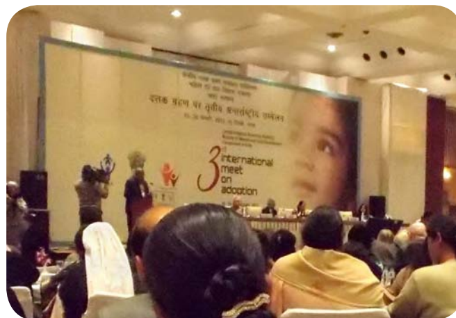
International Meet on Adoption, New Delhi