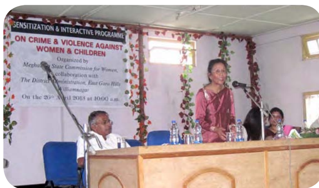
Sensitization & Interactive Programme on Crime and Violence against Women & Children