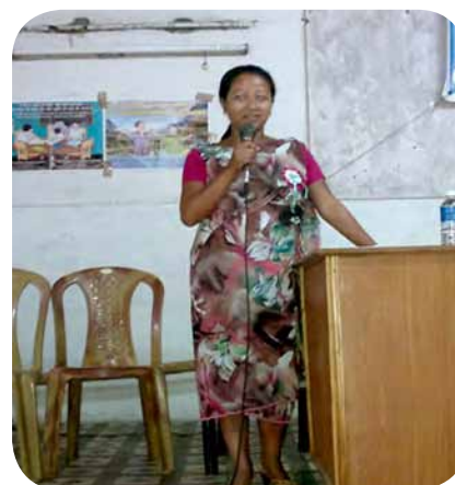
Officers delivered speech organised by Christian Endeavour Society Umrangksai - On 4th October, 2012