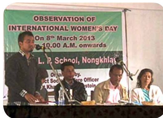
Observation of International Women's Day on 8th March, 2013

June, 2012 at District Social Welfare Office, also assisted the District Social Welfare Office in Observing the Communal Harmony on the 27th August, 2012 and International Day for Older Persons on the 28th September & 1st October, 2012. The District Child Protection Officer attended the International Day for Women on 8th March, 2013 organised by District Social Welfare Office, Nongstoin at Lower Primary School, Nongkhlaw, Mairang Sub Division and delivered speech on the workings of Integrated Child Protection Scheme (ICPS) its aim and objective and also gave introduction about the office of the District Child Protection Unit