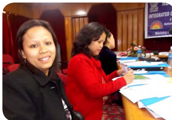
Consultation Meet at NIPCCD, Guwahati

It was also discussed the training need on Child Tracking System, Sensitization Programme, presented paper on the status report of State Adoption Resource Agency (SAA).