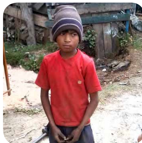
Mapping of child labour

The Protection Officer (Institutional) and the Social Worker conducted an inquiry on 23rd August, 2012 on case history of a child in need of care and protection in Shelter Home, New Colony. The Probation and Protection Officer (Institutional) conducted an inquiry on the 5th September, 2012 on case history of a child in need of care and protection in Rilang Shelter Home, Nongshilliang and on the 11th September, 2012 in Basan Roy School in the case of corporal punishment. The concerned officers visited the office of District Medical and Health Officer and Directorate of Social Welfare Officer for follow up on inspection committee.