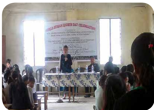
Legal cum Probation Officer delivered speech during the Human Rights Day Celebration