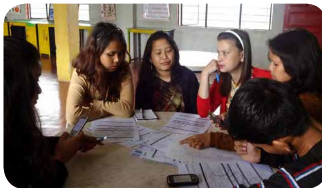
Inspection at William Lewis Boys Home (Orphanage), Mawphlang

The District Child Protection Officer, Legal cum Probation Officer, Protection Officer (Institutional Care) and Social Workers inspected Rilang Shelter Home, Nongshilliang, Nongthymmai and 21st March 2013 to check the infrastructure and maintenance of the home. Also, the Protection Officer (Institutional Care), Protection Officer (Non Institutional Care) inspected St. Xavier Francis, Mawsynram on 5th February, 2013 on child in need of care and protection.