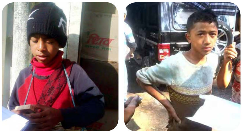
Street children / child labour

The Counsellor took up counselling session at Observation Home Girls, New Colony on 6th February in the case of an accomplice in a rape case and theft case as well as in Rilang Shelter Home in a case connected to abandoned children. From 11th – 18th February, Counselling in the case of an accomplice in rape and theft case at Observation Home Girls New Colony was also conducted.