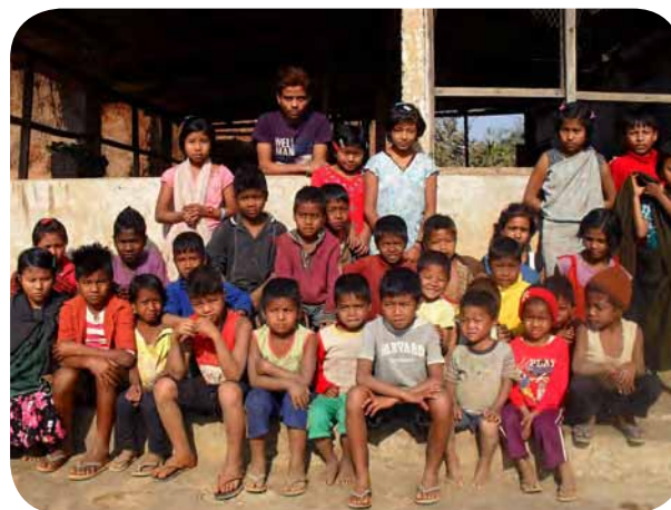
Holy Heart Orphanage, Killing