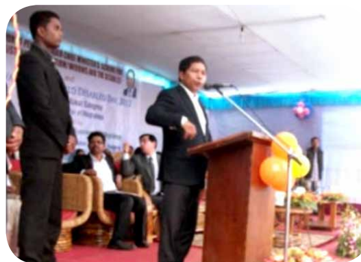
Observation of World Disabled Day

The officials attended the meeting of Child Welfare Committee (CWC) and in Deputy Commissioners Chamber Williamnagar and discussed issues on child labour.