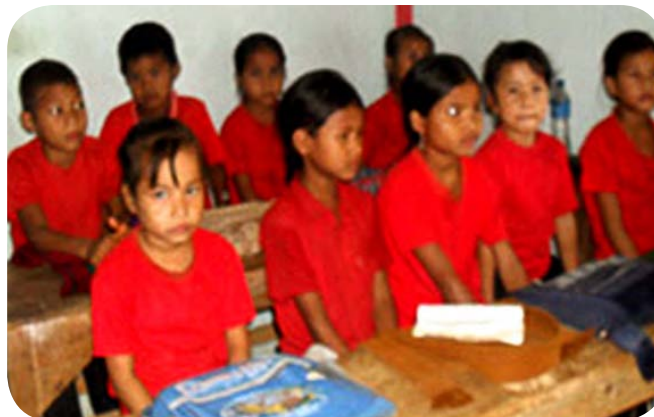
Inspection to L.P. School, Umkon for setting up Children's Home

The officers took up follow up cases of JJB at Saidu. During the month of January, 2013 a meeting was held with the Deputy Superintendent of Police for clarification on Juvenile Cases, and took up follow up case on JJB at Umsning as well as an inquiry was made for JJB case at Umsning on February, 2013.