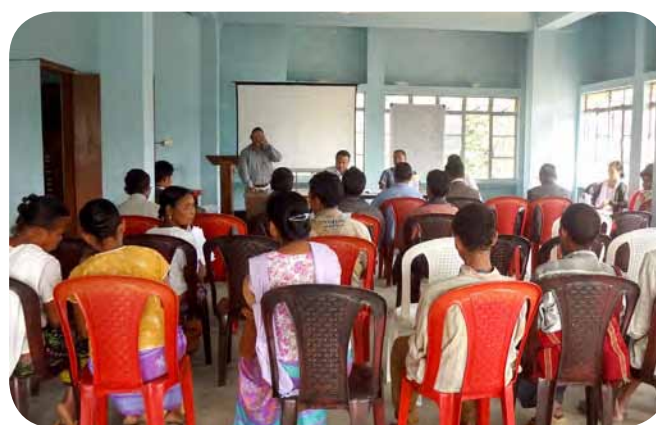
BLCPC at Gasuapara