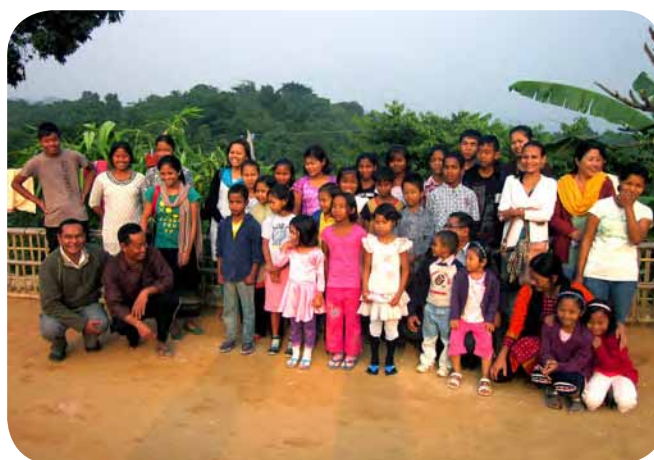
Free Life Centre, West Garo Hills

had a meeting with the executive members of Free Life Centre. At present, the organisation is running a home for the orphans and destitute mainly with the capacity of 21 children (Girls: 12, Boys:9). No fund has been received from the Government except donations received from different church denominations. So far, the centre has registered only under the Society Act and JJ Act is still on the process. The main purpose for visiting the centre was for Specialised Adoption Agency (SAA) facilitation.