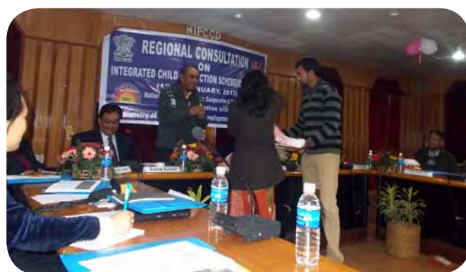
Consultation Meet at National Institute of Public Co-operation and Child Development (NIPCCD), Guwahati