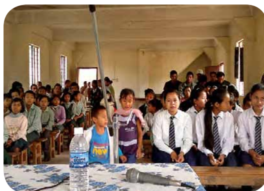
Participants in the Human Rights Day Celebration