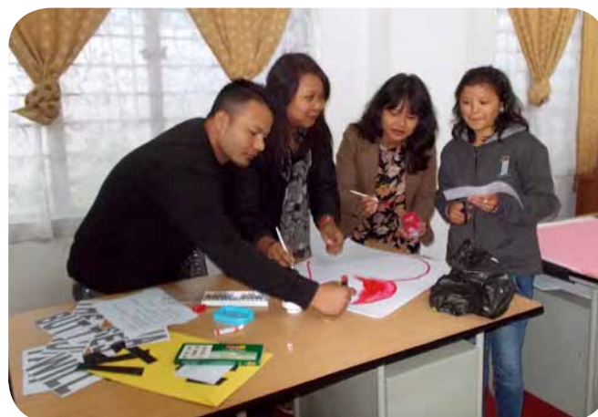
Republic Day Preparation