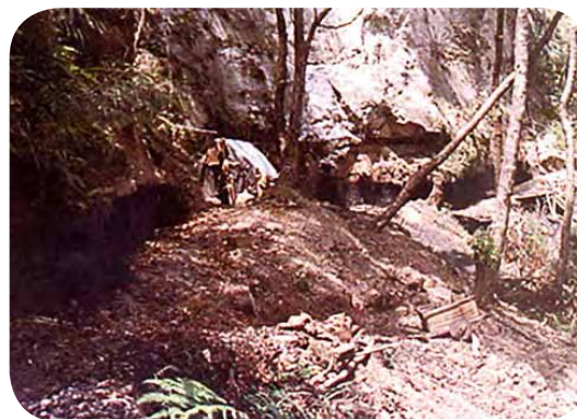
Coal pits at Borsora

The District Task Force on Child labour Committee meeting was convened at the Deputy Commissioner's Office where various issues concerning child labour was discussed. As a mark of curbing child labour, the Deputy Labour Commissioner and the District Child Protection Officer inspected the coal mine areas, saw mills areas and restaurants around Nongstoin District.