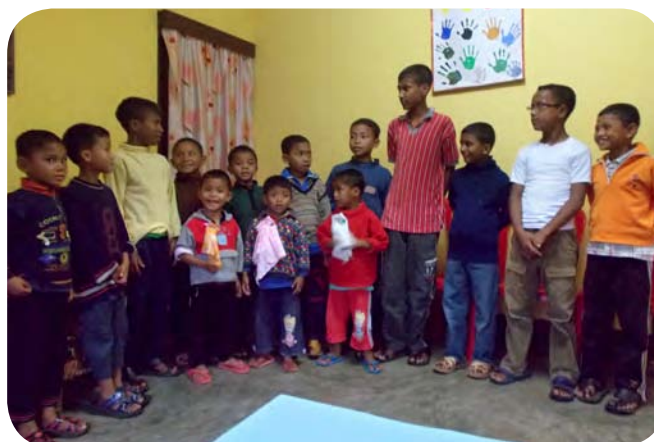
Lawei Baphyrnai Boys Home

the 14 was submitted by the organisation to the Child Welfare Committee, East Khasi Hills District and State Adoption Resource Agency (SARA). The proposal for setting up of Specialised Adoption Agency (SAA) by the Reach Ministry has been approved by the State Government and funds has been released by the Government of India during the current year. Also, the officers assisted the Sister in-charge of the Missionary of Charity to the District Social Welfare Office for registration of this particular home under the Juvenile Justice Act.