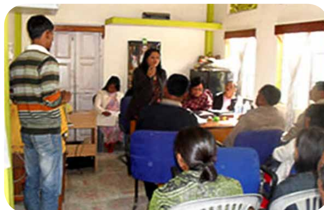
Child Welfare Committee (CWC) Sitings for the case of (7) seven minor children