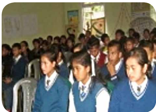
International Day Against Drug Abuse & Illicit Trafficking

The District Child Protection Officer (DCPO) assisted the District Social Welfare Officer and conducted three programmes, viz., the International Day Against Drug Abuse & Illicit Trafficking on the 15th June, 2012 at Rangblang, West Khasi Hills, International Day Against Drug Abuse & Illicit Trafficking on the 26th