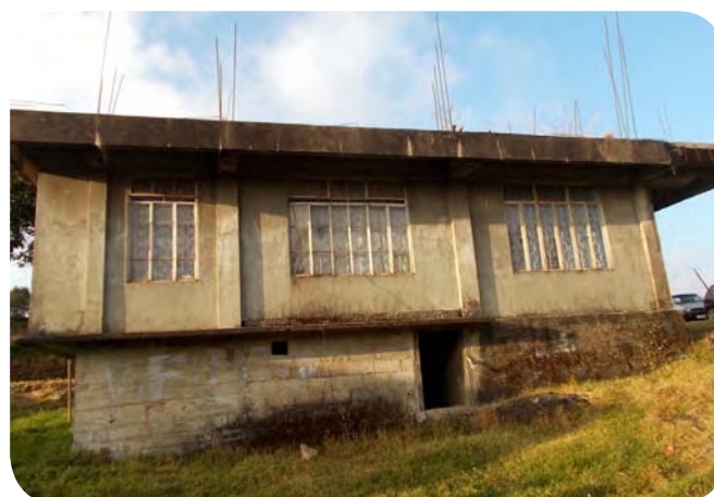
Hope Orphanage, South West Khasi Hills

the executive members who runs the home. No fund has been received from the Government till date. The Home is functioning through donations among the members only. The organisation has already registered itself under the Society Act 7 of 1990 as well as the Juvenile Justice Act 2006. The organisation has an infrastructure of its own for setting up Specialised Adoption Agency (SAA). However a proposal along with the documents required for setting up Specialised Adoption Agency (SAA) has already been furnish to State Adoption Resource Agency for necessary action.