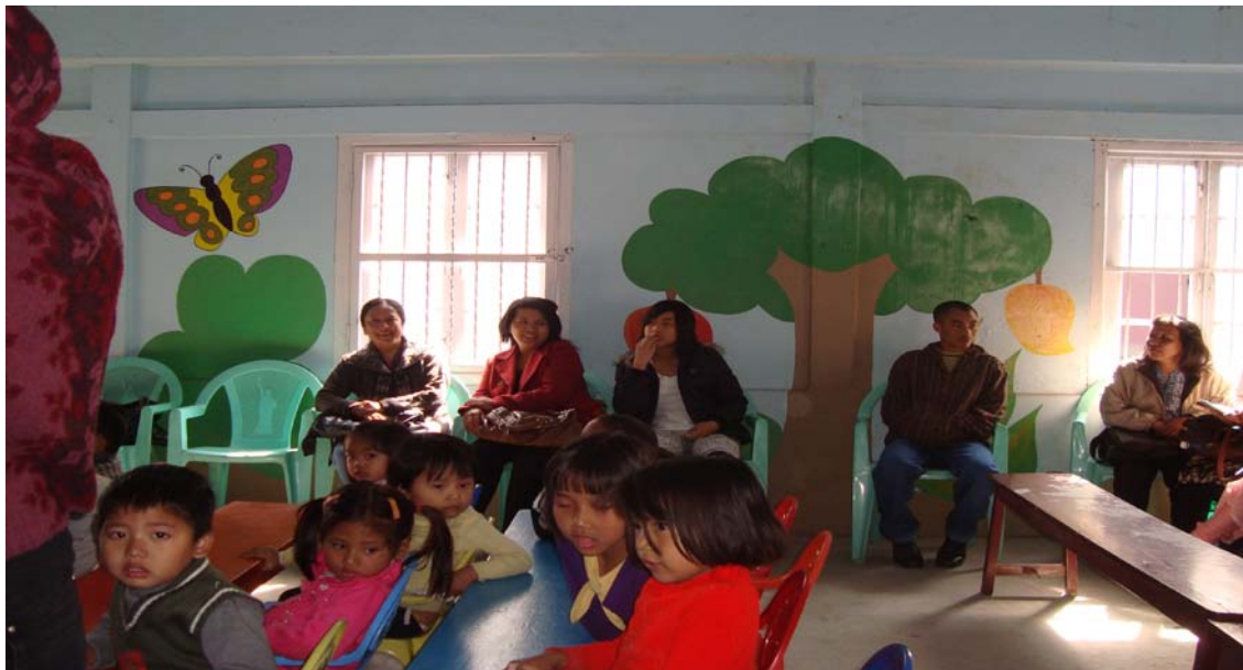
Dwarpai AWC (Urban)