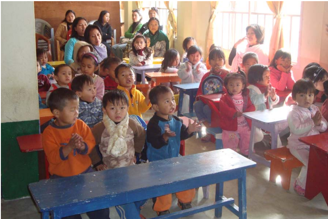
Khatla AWC (urban)