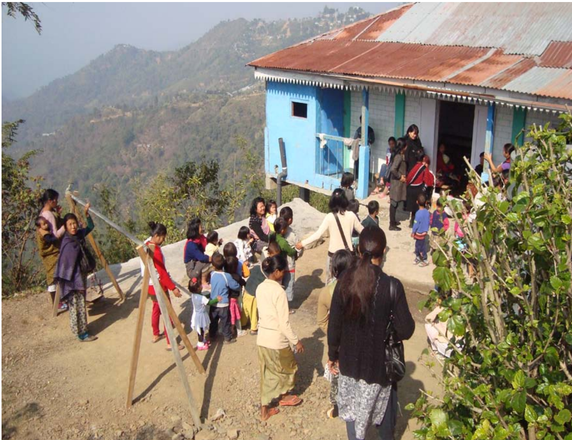
Hualngohum AWC (Rural) under Aibwak ICDS Project

On the first day the group was taken to two rural ICDS Projects i.e. Tlangnuam ICDS Project and Aibank ICDS Project. The name of centres visited are Hlimen AWC and Melthum I AWC under Tlangnuam ICDS Project and Hualngohmun, Molriat and Talkawn III under Aibawak ICDS Project.