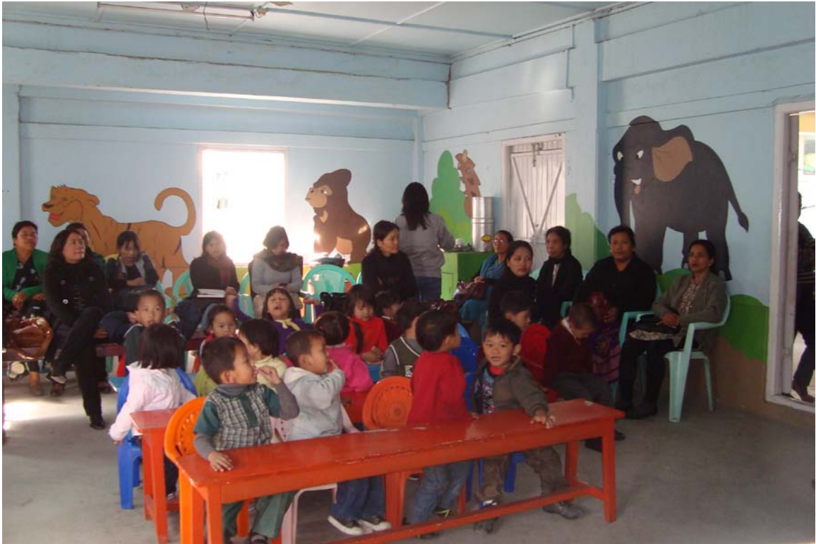
Animals Painted on the wall. Dwarpai AWC (Urban)