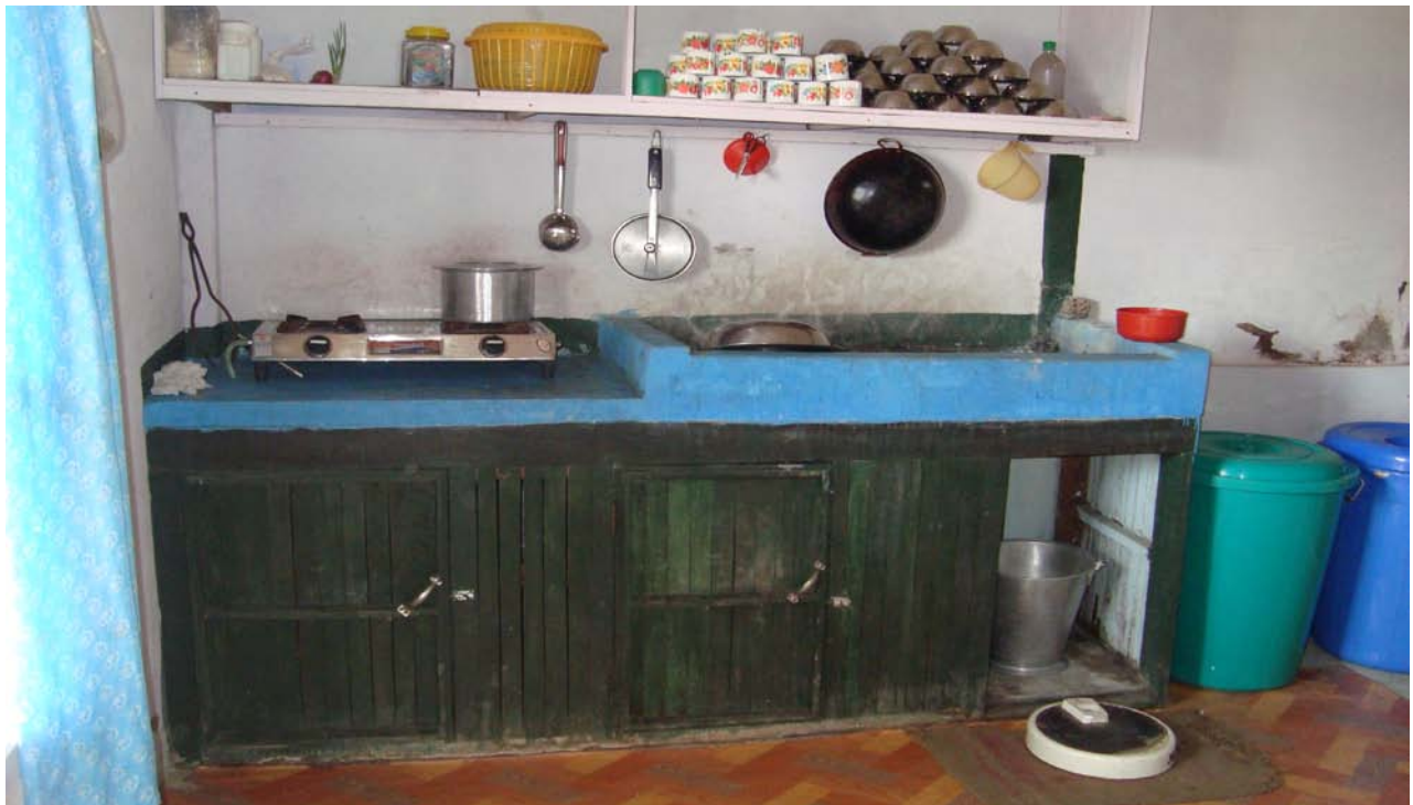
Kitchen of Hlimen AWC under Tlanguam ICDS Project