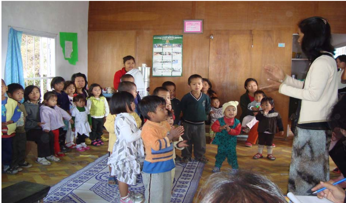
Melthum I AWC (Rural) under Tlanguam ICDS Project