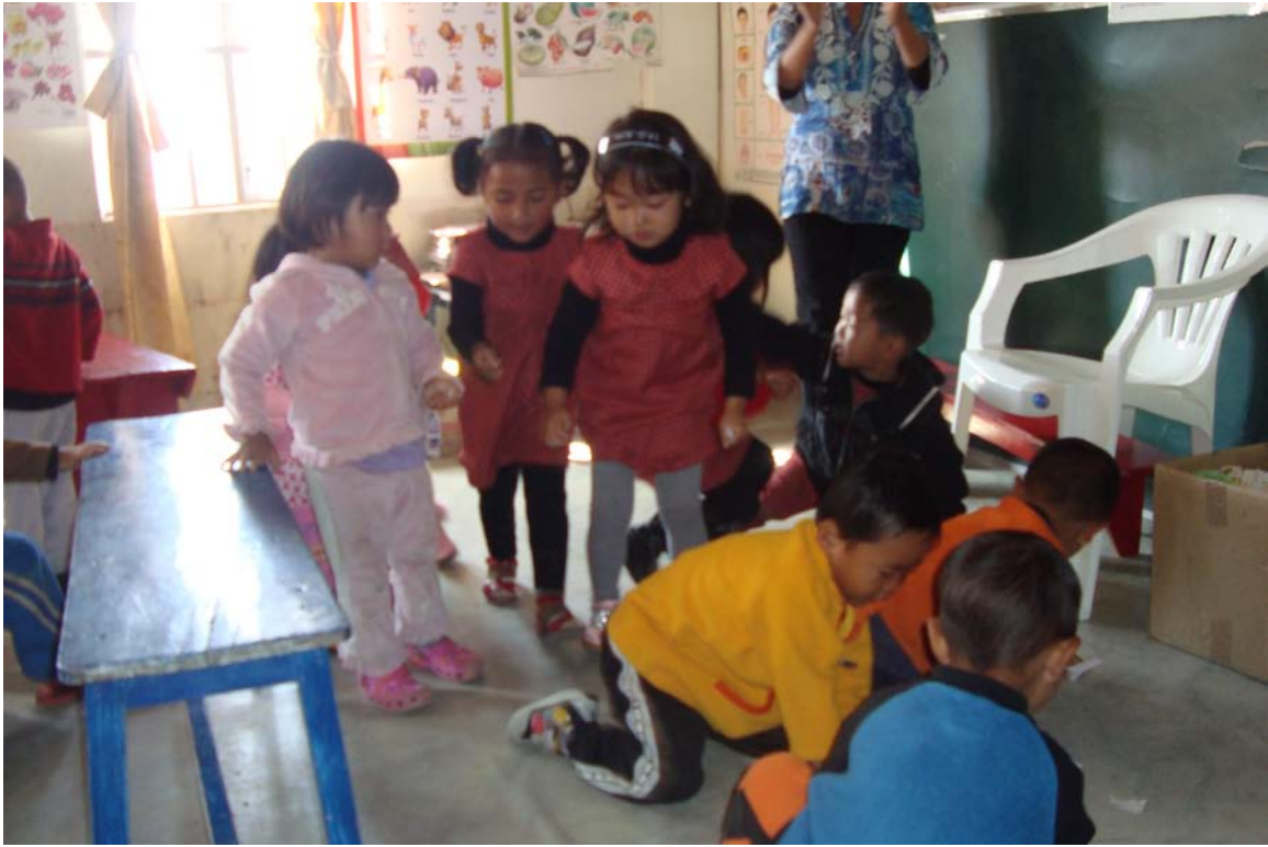
Pre- School children picking up chits of papers as part of cleanliness practices