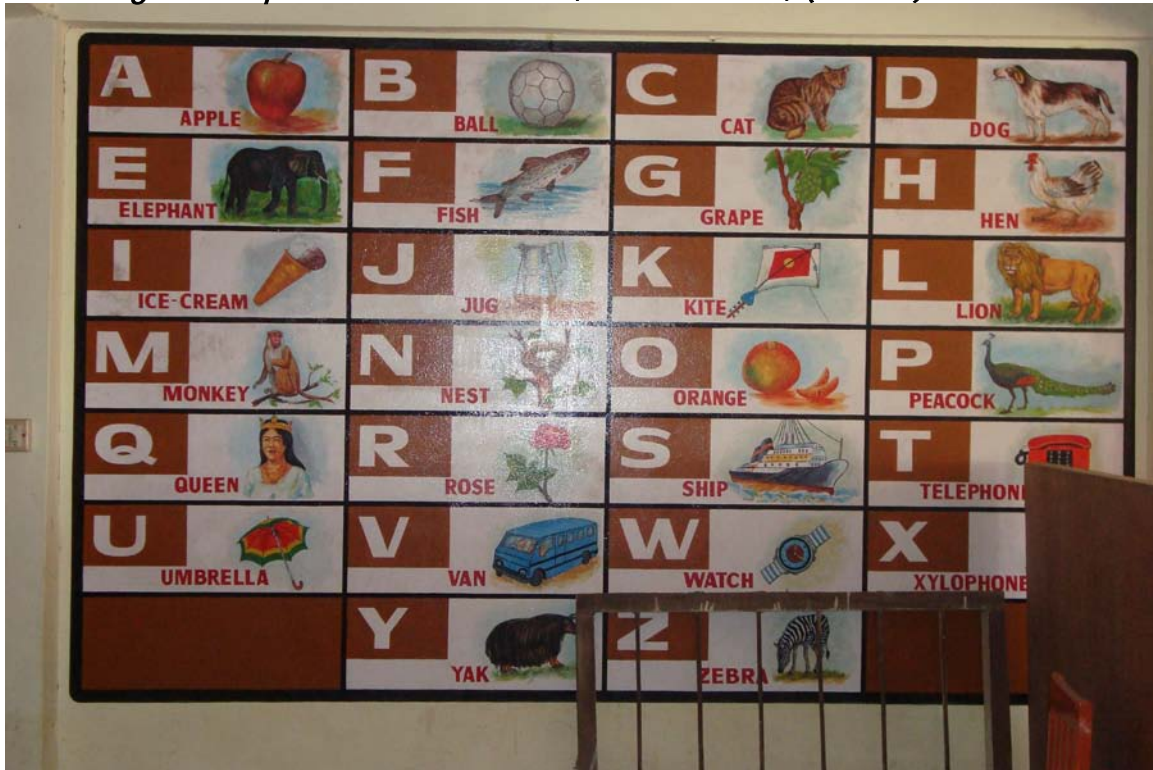
Teaching Board painted on the wall, Khatla AWC, (Urban)